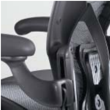
Lower-back PostureFit support