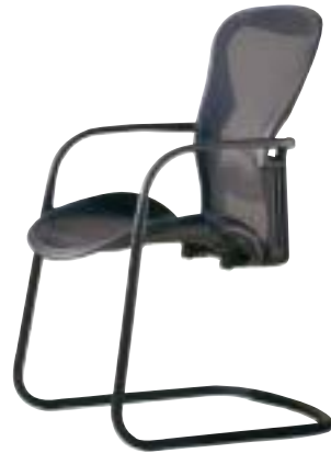
Aeron side chair