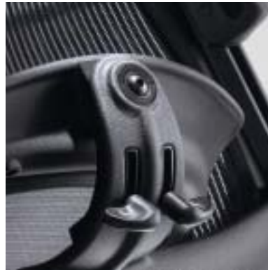
Adjustments at your fingertips

Some designs defy imitation, and the Aeron chair is one of them. Bill Stumpf and Don Chadwick purposefully designed it to be like no other chair—replacing foam and fabric with Pellicle ® , a breathable, form-fitting material that provides truly customized comfort and support. Extensive research shaped the original design. Continuing research ensures that Aeron remains the benchmark for performance in ergonomic seating. You won't find anything else like it, anywhere.