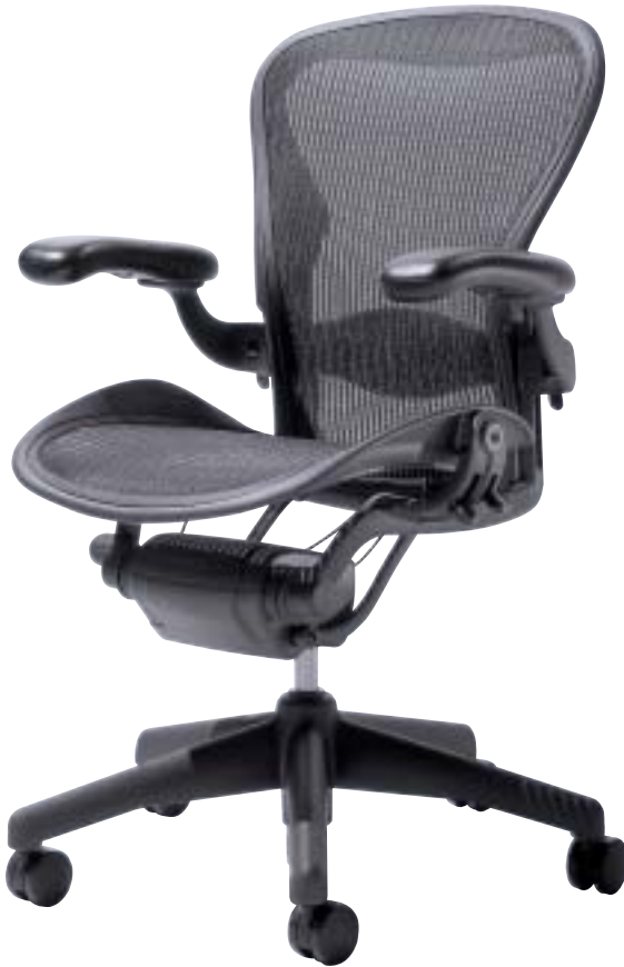
Aeron work chair

Herman Miller builds the Aeron chair responsibly, conscious of its environmental impact. It's 94 percent recyclable, with 66 percent recycled content.